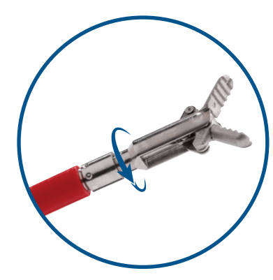
360° bidirectional rotation for targeting bleeds.